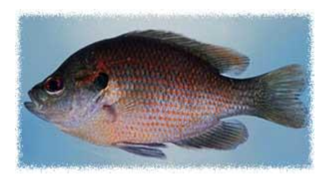
Redspotted Sunfish Lepomis miniatus