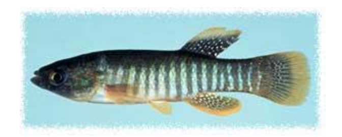
Gulf Killifish Fundulus grandis