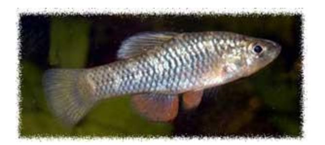
Rainwater killifish Lucania parva