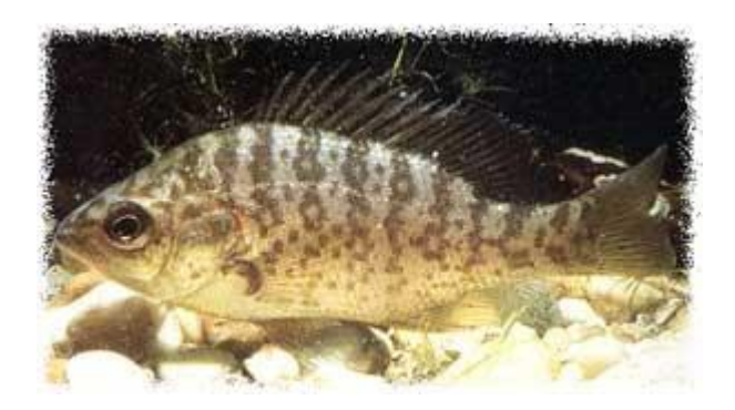
Redear Sunfish Lepomis microlophus