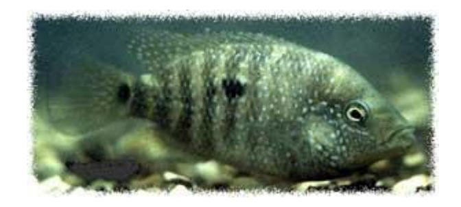
Rio Grade Chiclid Herichthys cyanoguttatus