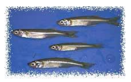
Inland Silverside Menidia beryllina