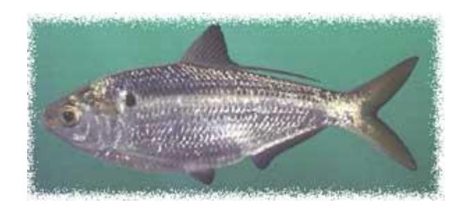
Theadfin shad Dorosoma petenense