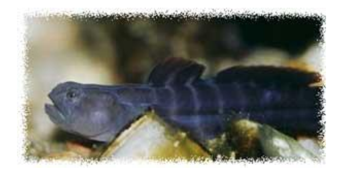
Naked Goby Gobiosoma bosc